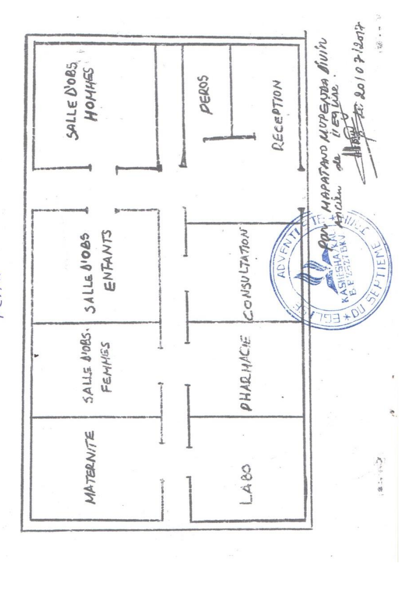
PLAN DU CENTRE DE SANTE BULUNGU/ADVENTISTE BOLONGU/ADVENTISTE HEALTHGARE CENTER.