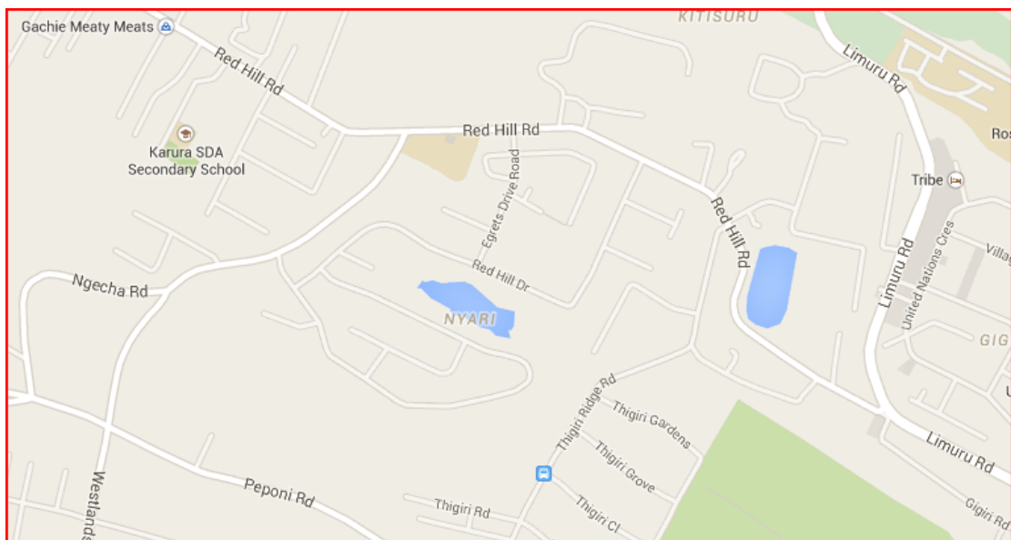
Fig. 1 Karura SDA School on Redhill Road off Limuru Road

Karura Adventist School is situated in Nairobi, the capital city of the republic of Kenya. Situated 12 kilometers from the city center, it has a good climate with a beautiful scenery ideal for learning and other activities. This also makes it strategically placed, with access to good roads. The National parks, International Airport, good transport system, Banks, and the United Nations Environmental Program (UNEP) offices are all within reach for any counsel or advice on environmental challenges.