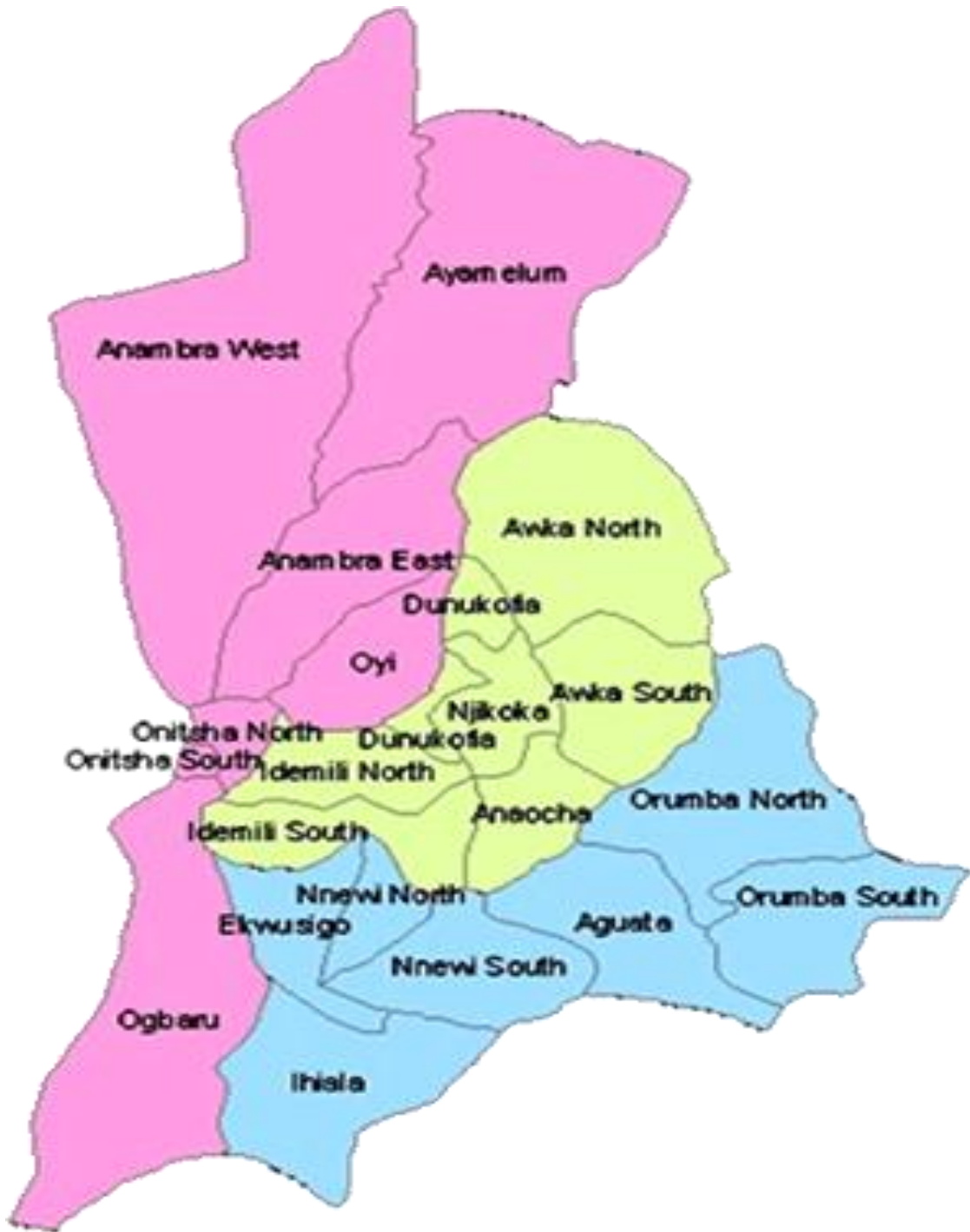
Figure 1: Map of Anambra State and its 21 Local Government Areas 17