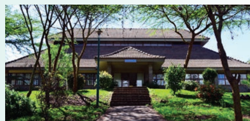
AUA, Nairobi, Kenya