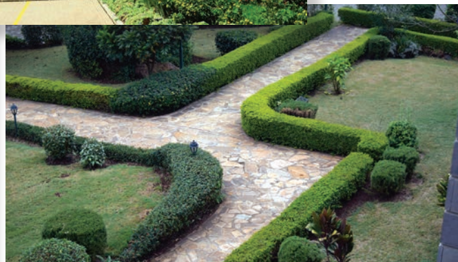
Current Grounds 2016