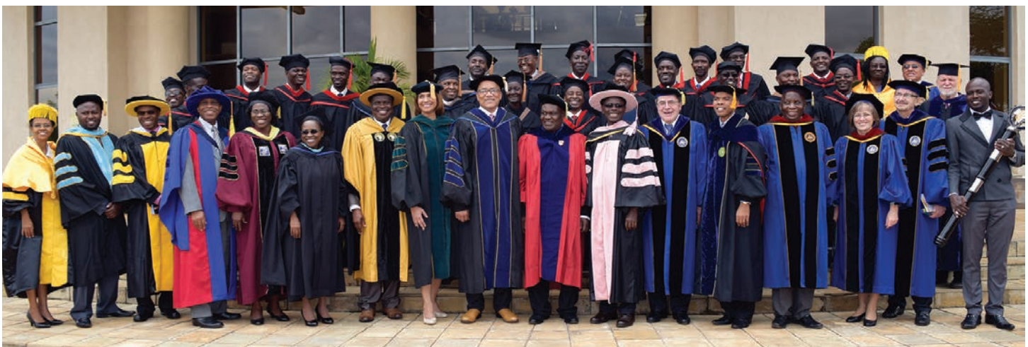
Faculty, speakers and graduates at Graduation, 19 June 2016.