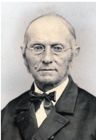
Joseph Bates, the first known Sabbath-keeping Adventist to come to Battle Creek in 1852 and win converts.

“The history of the Seventh-day Adventist Church has been closely linked to education.”