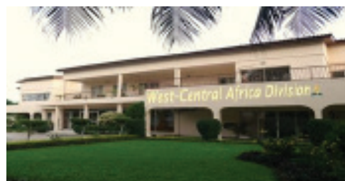
WAD, Abidjan, Cote d'Ivoire