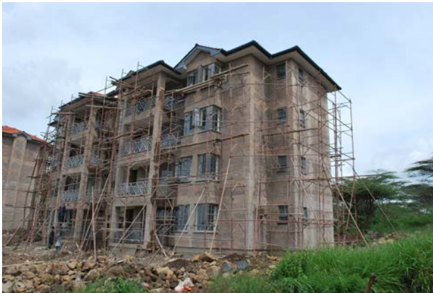
Student Hostels - 2010