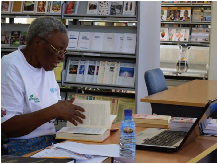
Student in the Judith Thomas Library, a beloved campus spot.