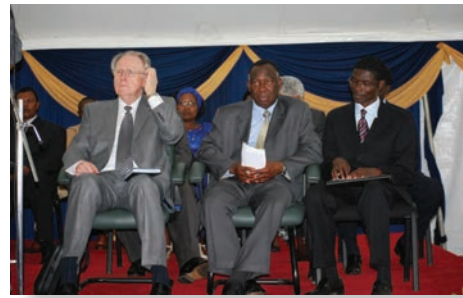
May 16, 2010 First SDP Funds Drive