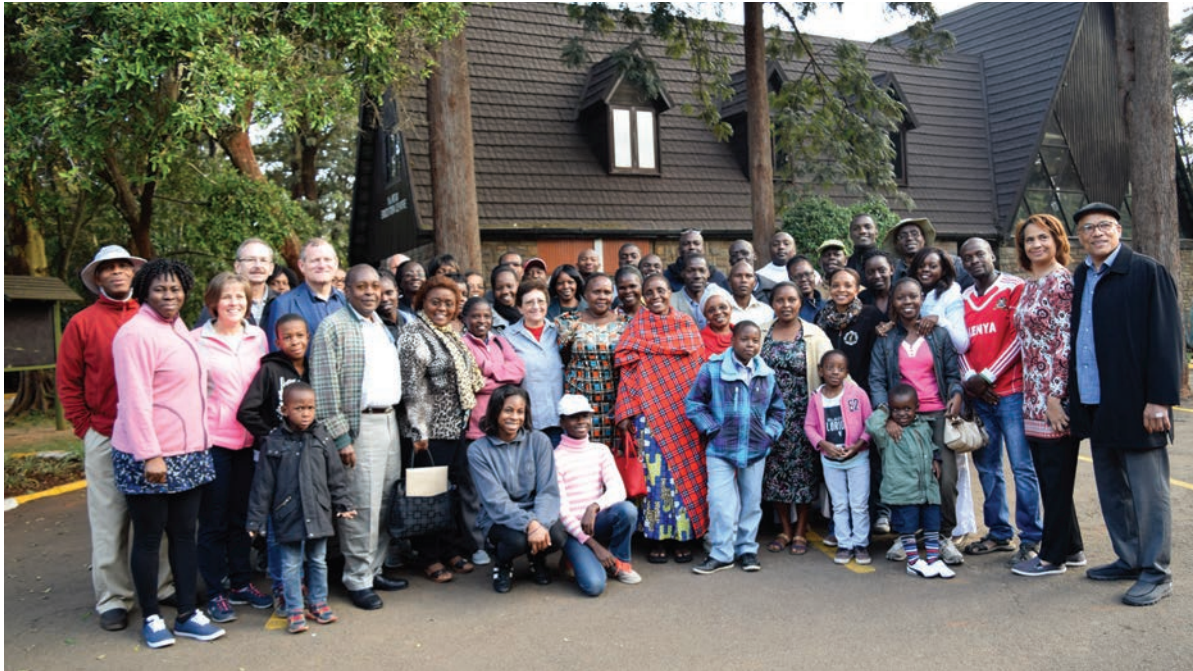
AUA faculty and staff with their families on the One-Day Retreat, 2016.