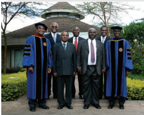
May 9, 2008 Granted Letter of Interim Authority