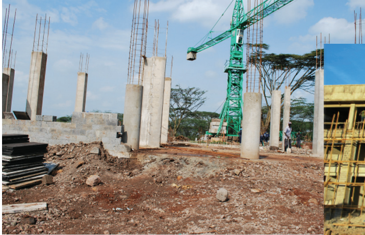
Judith Thomas Library - 2010