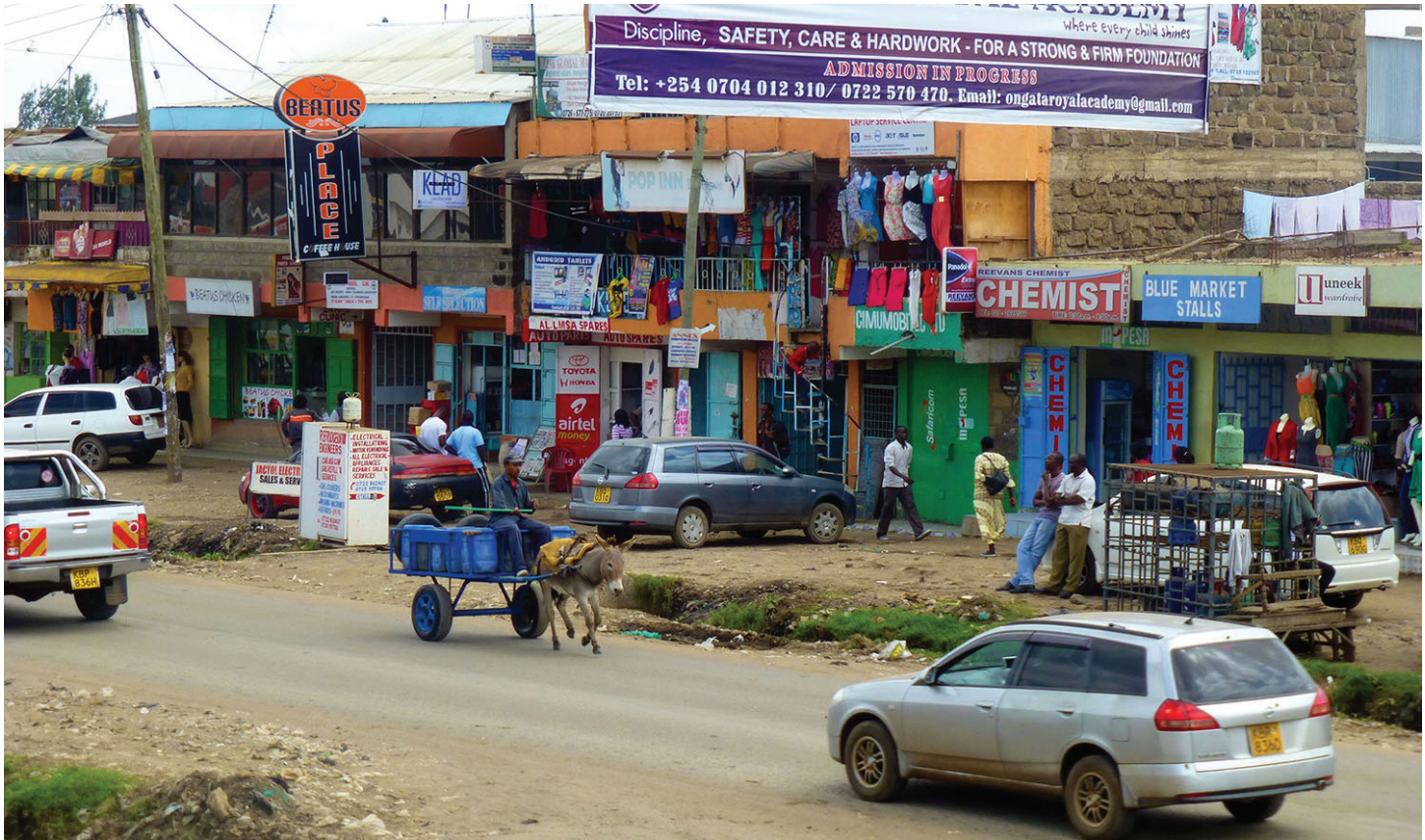
Ongata Rongai, the nearest town neighboring AUA