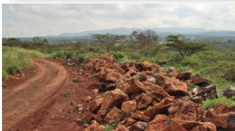
September 13, 2005 AUA Administration Building Groundbreaking