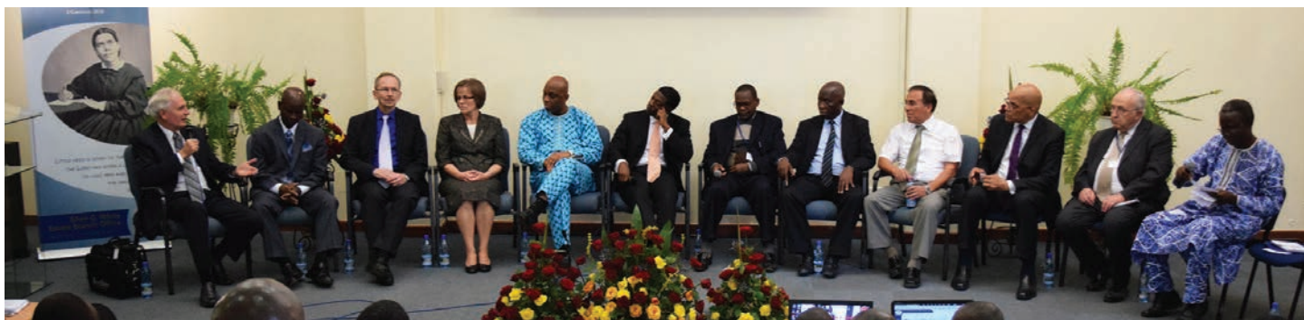
The first Spirit of Prophecy Symposium held in Africa at AUA, 27-30 July 2016.

A quarterly electronic newsletter The Highlights is published in English and Swahili languages. This dynamic newsletter has subscribers in Africa and across the world. Its practical articles feature subjects focused on Christian experiences on this earth, the way to salvation in Christ, and the joys of the world to come.