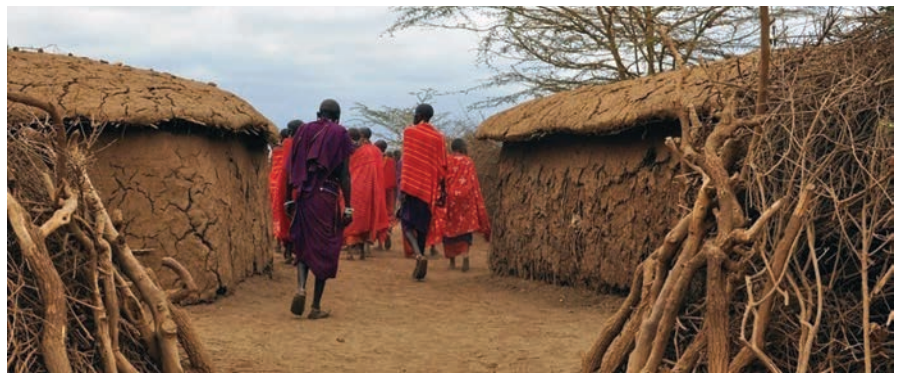
Maasai Community that also neighbors AUA

AUA has the plan and commitment of administration, faculty, staff, and students to make a distinct difference in the immediate future by using the method of Christ (See Ministry of Healing , 143).