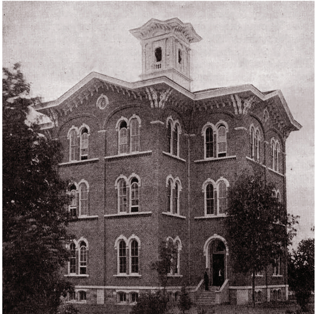
Battle Creek, first established in 1874.

The history of the Seventh-day Adventist Church has been closely linked to education. In 1853, ten years before the church's General Conference was formally organized, the first elementary school started operating. Twenty-one years later (1874), the church established its first college in Battle Creek, Michigan. By the year 1900, Seventh-day Adventist schools had already been established in Europe, Africa, Australia, and South America.