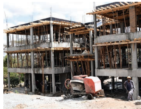
Fourth Student Hostel, completion to be in 2017.