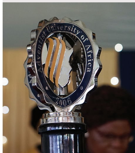
The AUA Mace

“AUA has a student representation from 32 African nations.”