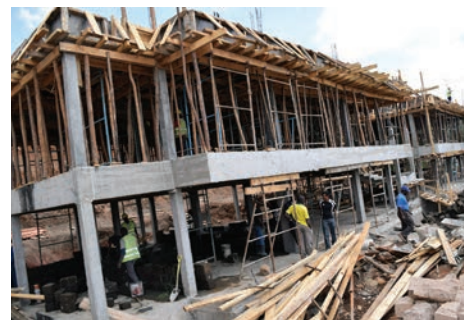
Faculty apartments, completion to be in 2017.