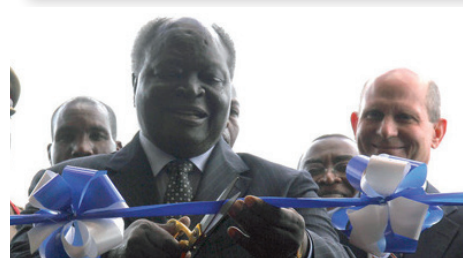
May 28, 2012 Judith Thomas Library Opening