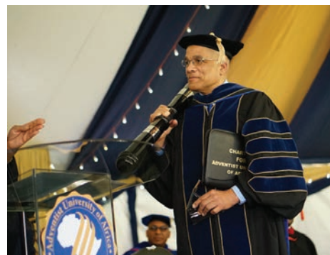
April 26-27, 2016 Installation of Second Vice Chancellor