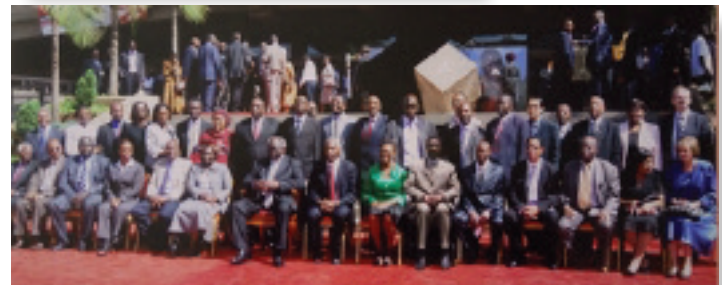
March 1, 2013 Granted University Charter