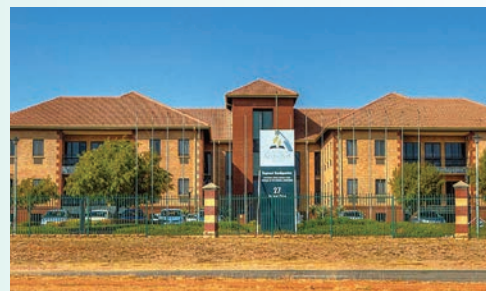
SID, Pretoria, South Africa