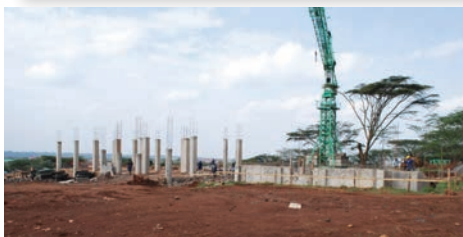
August 24, 2008 Judith Thomas Library Groundbreaking