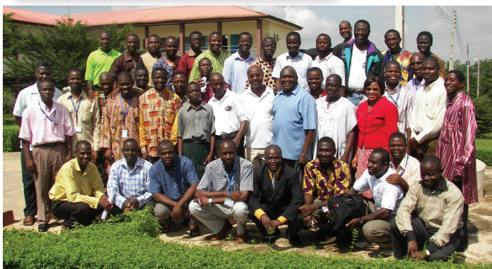
July 24-26, 2009 Alpha Graduation Ceremony at Babcock University