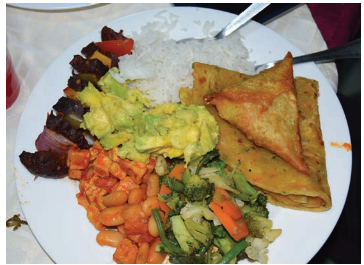
Meals in the ECD Cafeteria are a key part of the AUA experience.