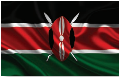
2004-2005 Selection of Kenya as the site for the Postgraduate Institution