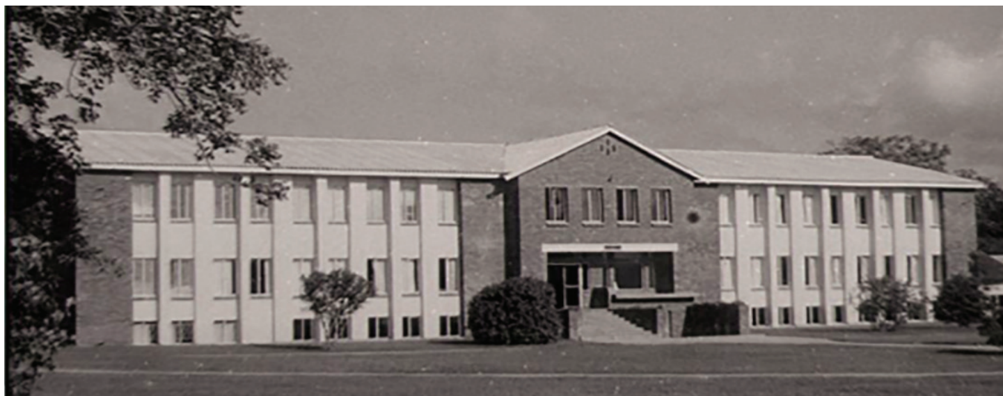
Solusi University, the oldest Seventh-day Adventist higher education institution in Africa, established in 1902