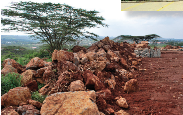
Original Grounds - 2010