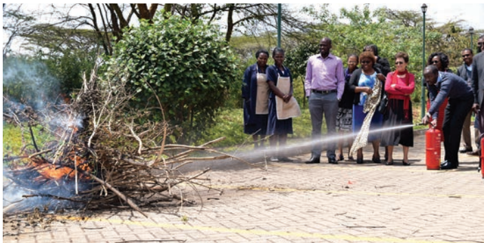
Faculty and staff engaged in Emergency and Fire Safety Training. Safety is a high priority on Campus.