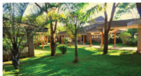
ECD, Nairobi, Kenya