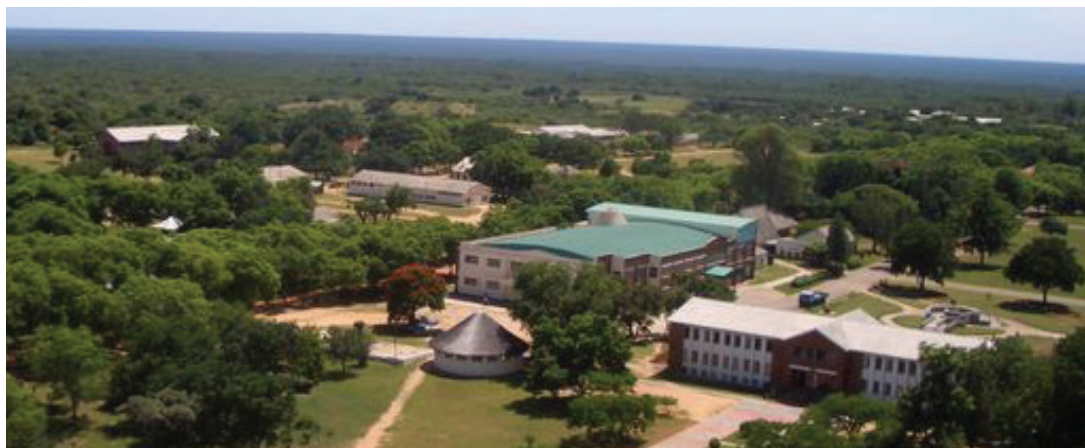
Solusi University, in 2016

“AAA is the denominational accrediting authority for all tertiary and postgraduate educational programmes and institutions.”