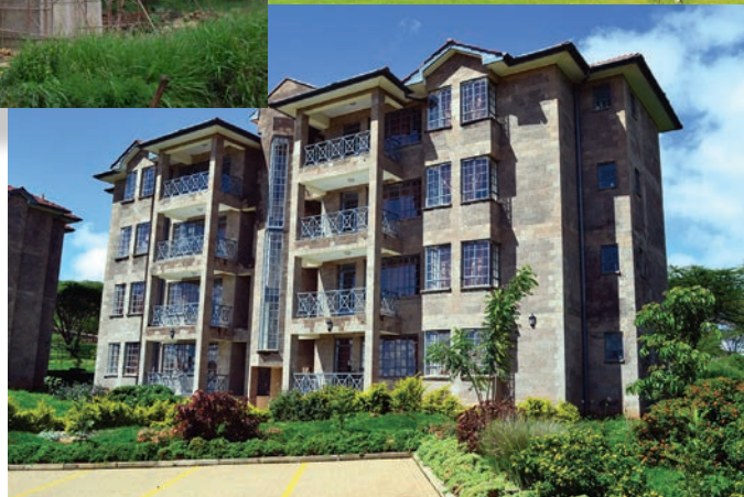
Student Hostels - 2012