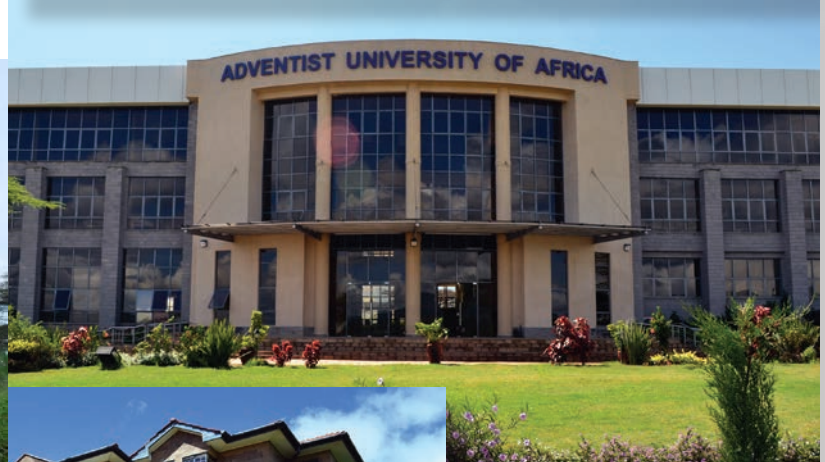
Judith Thomas Library - 2012