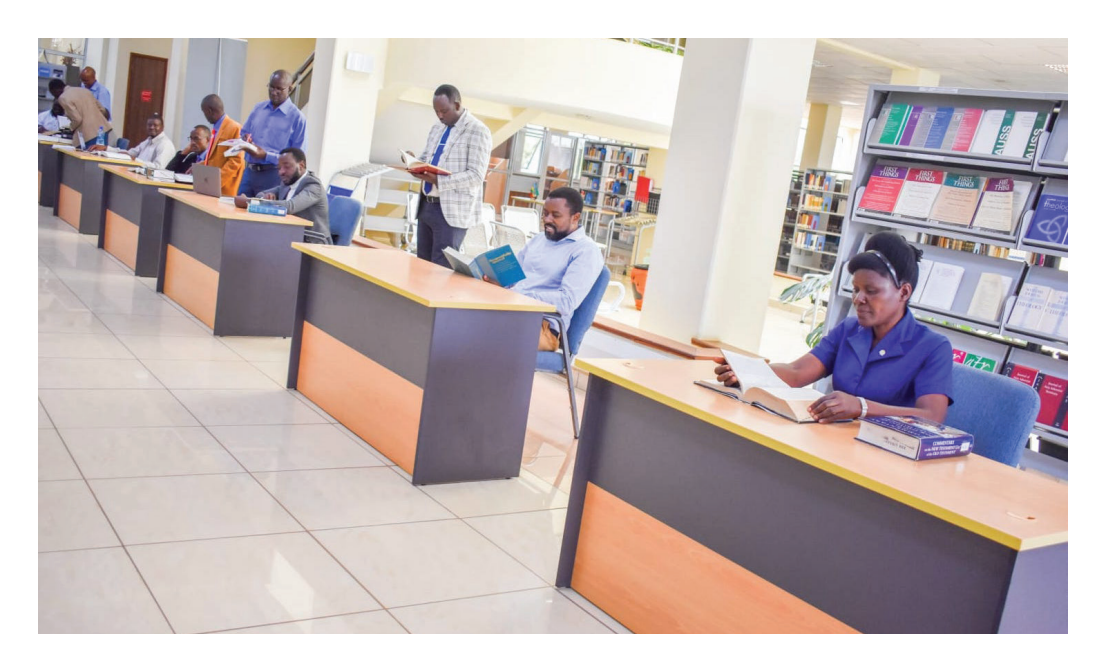
Reading area of the Library